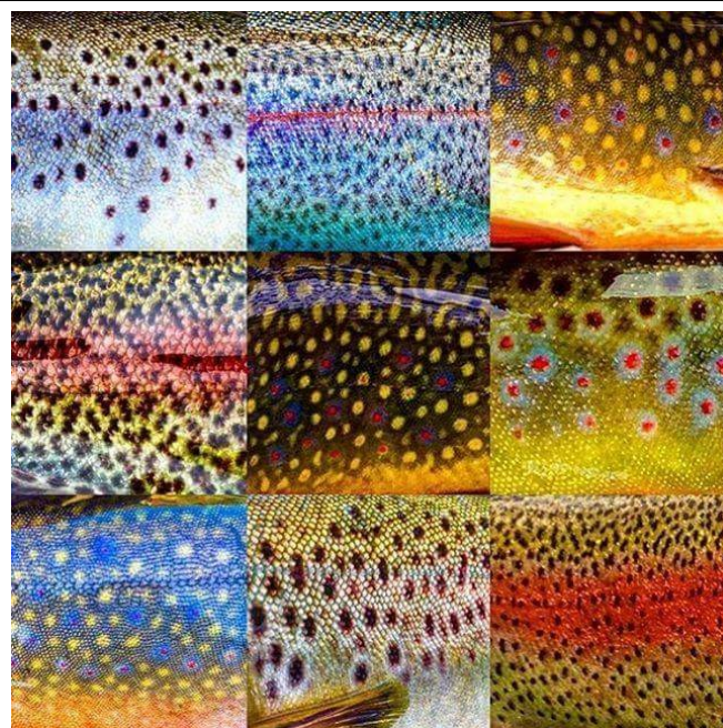
Beautiful collage of New England Trout Colors.

We hope to have Shannon back sometime in the future to share her findings with us. The Chapter wants to thank Shannon and all of the very dedicated individuals who have gone with her and helped her in this study.