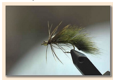
Pine Squirrel Streamer